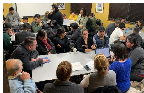
Focus groups at SKCE—table of teens and table of parents

SKCE has been working with the school board, the Salem Keizer School District, and the MP Early Learning Hub to support their outreach and community input process for the Student Investment Account (SIA). The district's task force will decide how to spend Salem Keizer's share, $35 million of new education funding. Parents, community members and school staff have identified struggling student groups who need intentional, focused resources. A part of that job was to conduct focus groups in our Spanish speaking community. Our fantastic parent/staff reached out to hundreds of program participants and conducted the largest number of focus groups with the largest number of Latino/a/x parents in the district. The advocacy of SKCE Latino/a/x staff and